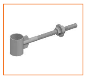
Heavy duty hinge